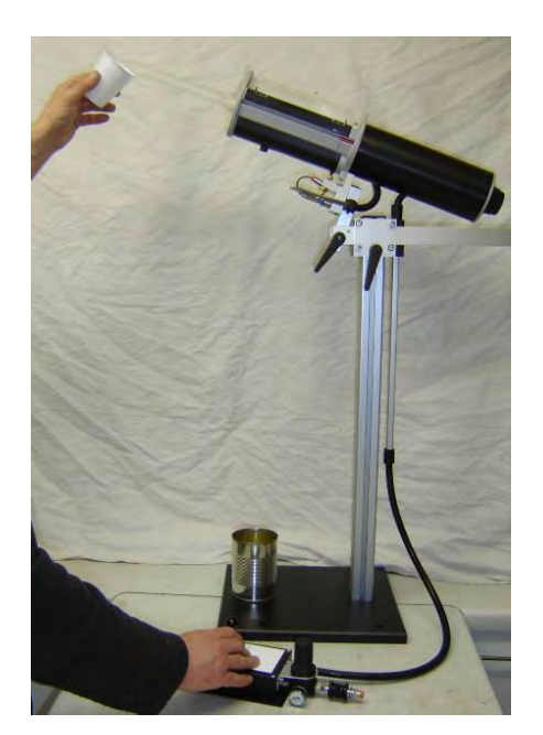
Multi axis adjustable gun support stand

Dispense on/off lever value & flow regulator. Optional footswitch.