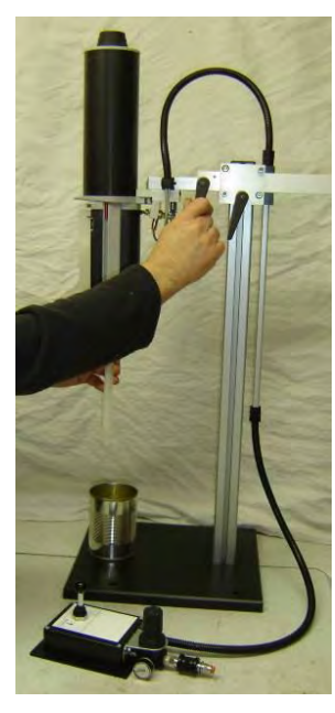
Adjustable vertical in/out and swivel