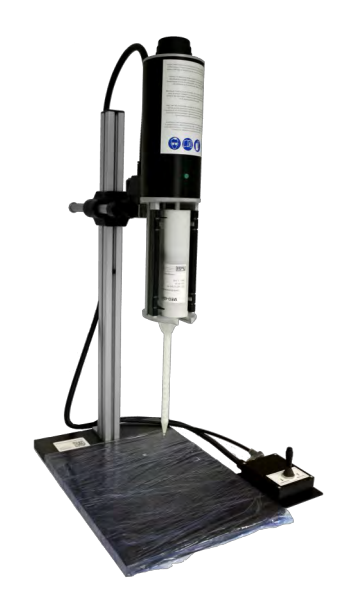
Bench top stand with hand switch

Dispense on/off lever value & flow regulator. Optional footswitch.